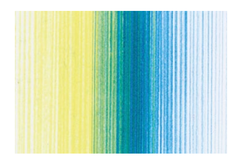
phthalo blue 110 on cadmium yellow 107

Colour gradients can be created by increasing the pressure during drawing, by covering a colour with a white or light colour pencil, or by lightening specific areas with an eraser pencil.